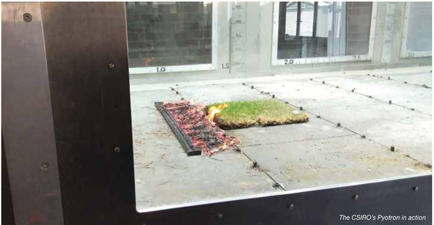
The CSIRO's Pyotron in action