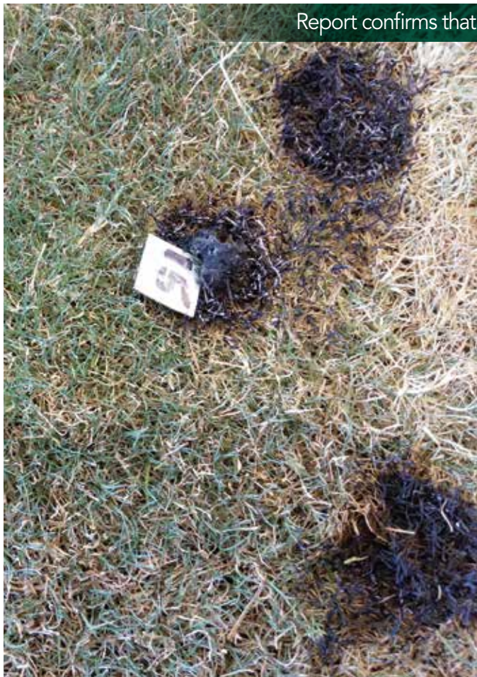
Report confirms that lawn provides a bushfire retardant space (continued)