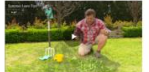
We all love a fresh, green lawn in summer. However drought and water restrictions have a serious impact on the garden.

Head over summer lawn tips? Watch the video below.