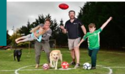
The family and their Labrador Bella and Zippah enjoy the soccer field.